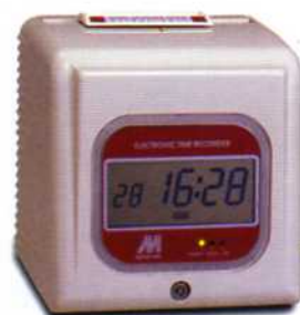
M-260 M-660 M-360 M-960