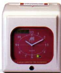
M-260A M-660A M-360A M-960A